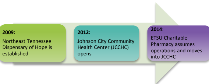
Figure 2: Timeline for establishment of charitable pharmacy services in Washington County, TN.

Serving a sizable percentage of Spanish-speaking patients, the pharmacy had to identify a method of translation for these patients, as no staff member is fluent in Spanish. By partnering with a FQHC, we were able to utilize existing interpreters who work at the clinic when interacting with and providing counseling for these patients. Many telephonic and video interpreting services are available, such as LanguageLine Solutions® for clinics or pharmacies who may not have interpreters on staff or may have needs for many different languages.