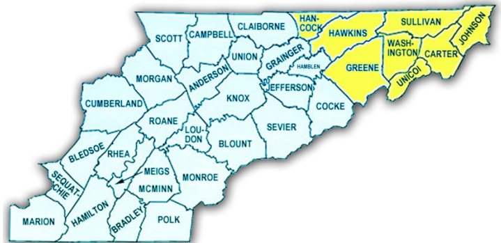
Figure 1: Map of Eastern Tennessee Counties

Northeast Tennessee, like much of the Appalachian region, struggles with a high level of poverty and limited access to health care. In Washington Co., TN the poverty rate is roughly 17.7%, with surrounding counties (Figure 1) ranging from 17.6-31.5% compared to the national average of 15.4%. 1,2 In 2009, the Northeast Tennessee Dispensary of Hope was founded in Johnson City, TN to provide access to prescription medications to those who lacked prescription drug insurance and could not otherwise afford their medications. Prior to implementation of the Affordable Care Act, it was estimated that 15.7% of the population in the state of Tennessee was uninsured. 3 A board of directors, including representatives from various healthcare disciplines and organizations, partnered with an area health system to bring medications at no charge to patients who met qualifications.