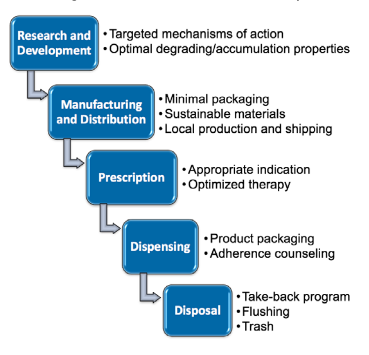
Figure 2: Sustainable Pharmaceutical Life Cycle