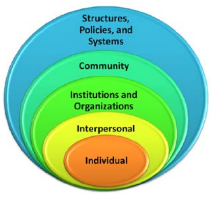
Figure 1 Social Ecological Model<sup>16</sup>

interventions that could be developed collaboratively between community members and pharmacists.