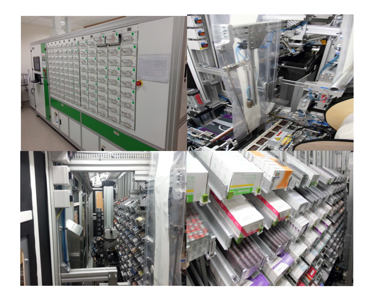
Figure 1: From top left clockwise: a) Drug Dispensing System (DDS); b) re-sealable bags and printing system; c) drug cartridges in the DDS; d) side view of the robotic arm picking medications