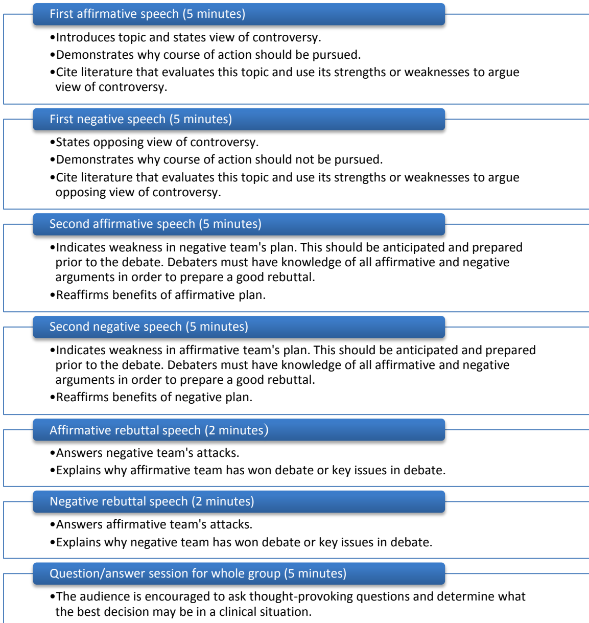
Figure 1: Debate Format and Timing