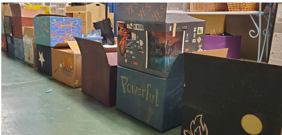
VOCA Camp boxes, lined up and ready to be packed with arts and crafts activities, songbooks, tie-dyed t-shirts, and food for VOCA Campers. (From author's archives, 2020).