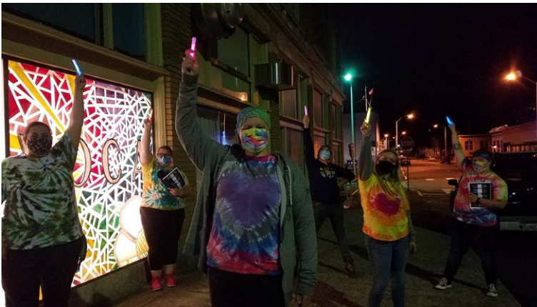
VOCA Core Committee members Light Up the Night as a planned activity during the first weekend of VOCA Camp in a Box, which included glow sticks for campers to use at a synchronized time. (From author's archives, 2020).