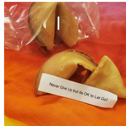
VOCA Camp custom-made fortune cookies. (From author's archives, 2020).