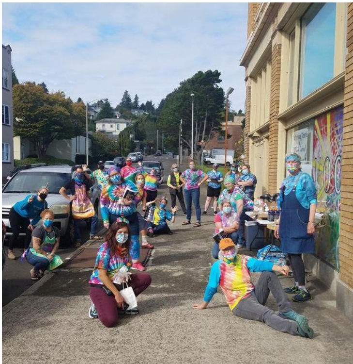
VOCA Core Committee members and volunteers pose before traveling by caravan to campers' homes to sing and share VOCA Camp boxes with families.