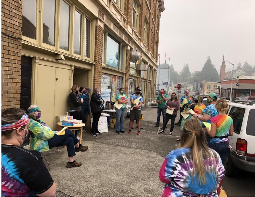
Despite smoky skies, VOCA volunteers gather for last-minute instructions before delivering VOCA Camp boxes to families. (From author's archives, 2020).