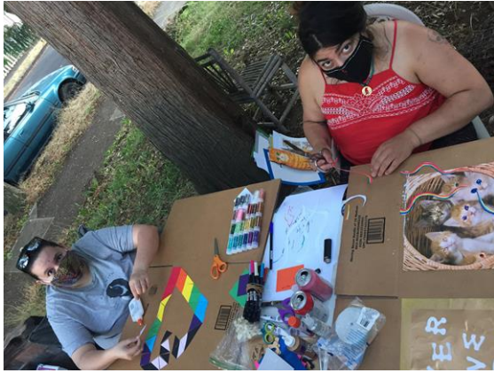
Volunteers decorating VOCA Camp boxes.