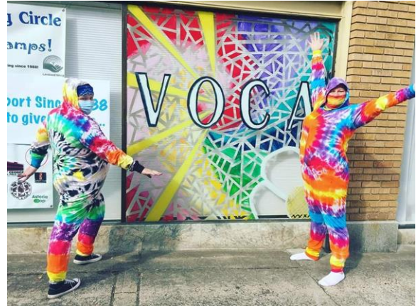
Core Committee members (aka Tie-dye Queens) express VOCA love in their newly dyed onesies.