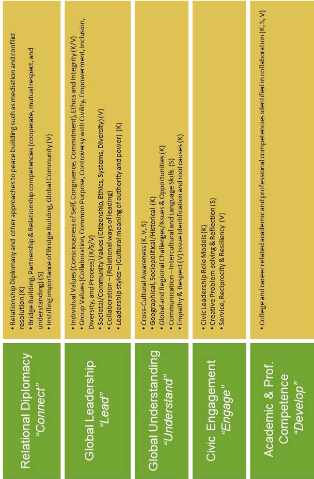
Figure 2. The Five Pillars of Global Citizenship.

Note: Knowledge (K), Values (V), and Skills (S) Learning dimension goals will be achieved through an intentional blend of relevant methodologies, such as readings, discussions, reflection, workshops, practice, observation, reflection, etc.