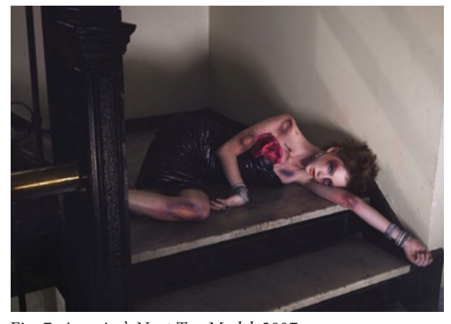
Fig. 7. America's Next Top Model, 2007.

Various advertisements and ad campaigns within the fashion industry feature dead or dying women, which demonstrates the persistence of the dead female body as a subject in art in the twenty-first century. In 2007, during an episode of the television series America's Next Top Model, the models posed as dead women in the middle of gory, horrifying crime scenes (see fig. 7). The models were asked to assume the characters of dead women while simultaneously selling the clothes that they were dressed in. Essentially, they had to embody death while framing it as sexy and alluring. The judges' comments about the photos shed light on the ways in which the fashion industry fetishizes dead young women. One of the models who was posed as if she had fallen from a building was told: "death becomes you, young lady" (Cochrane). Another model who posed at the bottom of a flight of stairs was praised