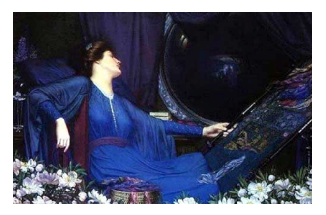
Fig. 1. Sidney Meteyard, "I am Half Sick of Shadows," Said the Lady of Shalott, 1913. Oil on Canvas.

opening her body towards viewers, suggesting that she is sexually vulnerable (see fig. 1). In addition, because her face is turned away from viewers, she is vulnerable to their gaze and has no power to turn her gaze away, making her submissive and visionless.