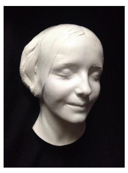
Fig. 5. L'Inconnue de la Seine.